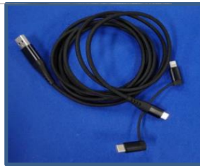
Foto del prodotto Picture of the item

L'oggetto descritto è conforme alla pertinente normativa di armonizzazione dell'Unione: The described object of the declaration is in conformity with the relevant Union harmonisation legislation: